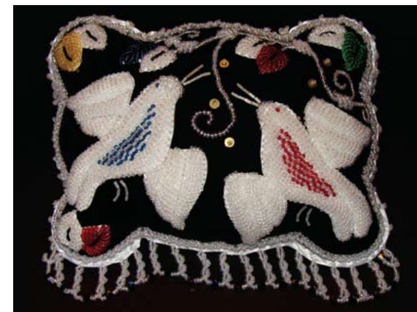
Original image: Spring Returns , black pincushion, Iroquois raised beadwork

First executed with bone and shell, Later with moose hair and hide, And now with glass beads and velvet, This art is a material language which Embodies, preserves and expresses Iroquois World View